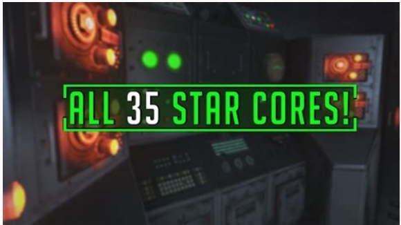
Star core locations outside galactic zone grounds. All star core locations outside galactic zone grounds. Nuka world star core locations in galactic zone grounds. Fallout 4 star core locations inside galactic zone grounds. All star core locations galactic zone grounds. Fallout 4 star core locations galactic zone grounds. Where to find the star cores in the galactic zone grounds.